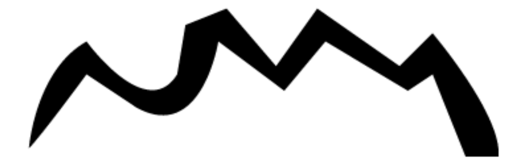
Jack O' Lantern - Worried